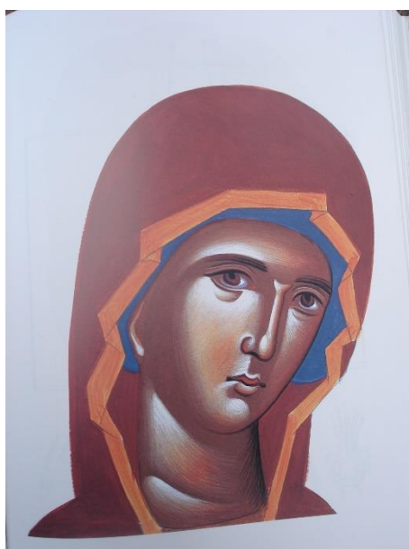
Adding a third light, and so on...