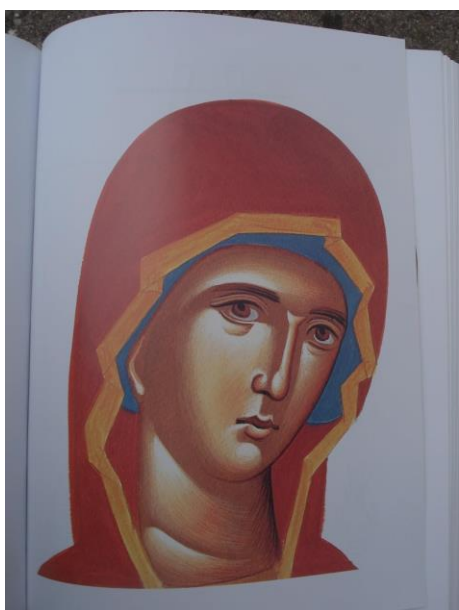
Adding a Second Light.