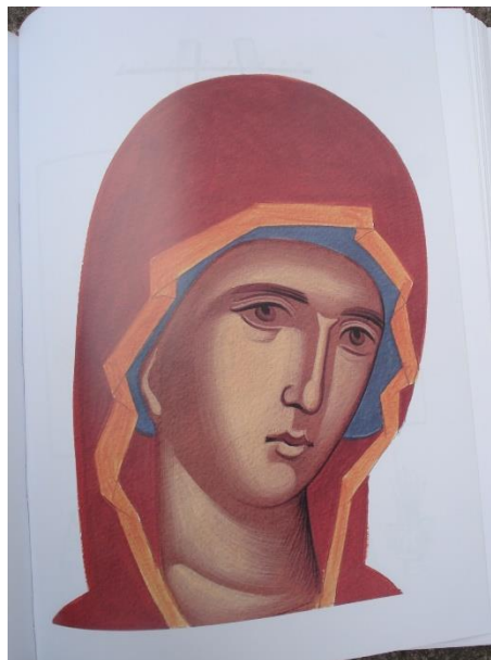
The adding of First Light.