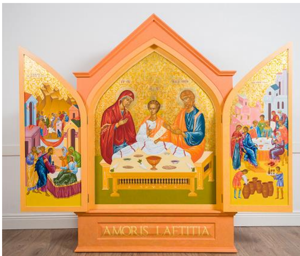
Icon of the Holy Family © World Meeting of Families 2018